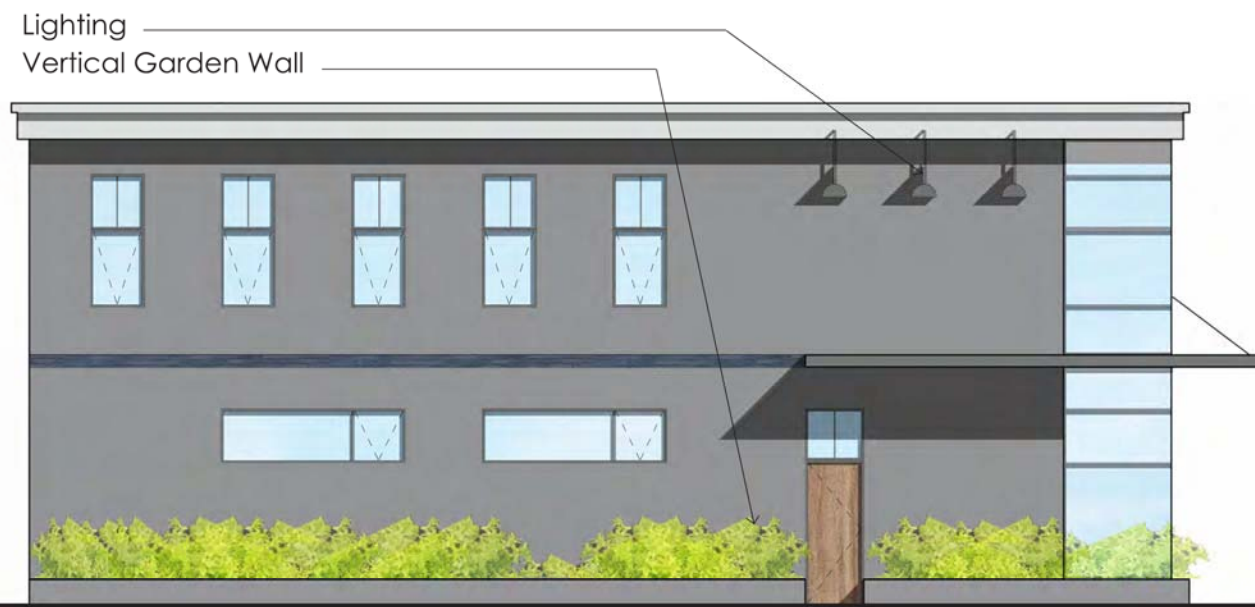
West Elevation Scale: 1/8" = 1'-0"