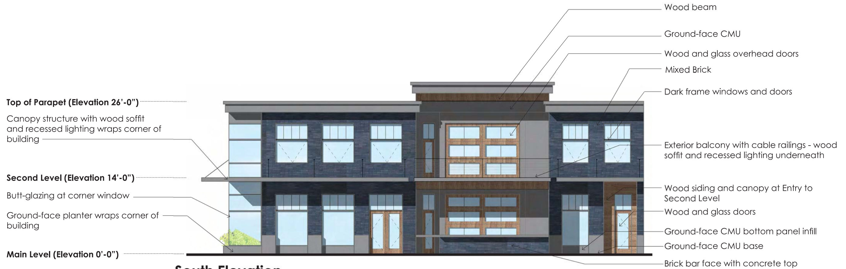
South Elevation Scale: 1/8" = 1'-0"