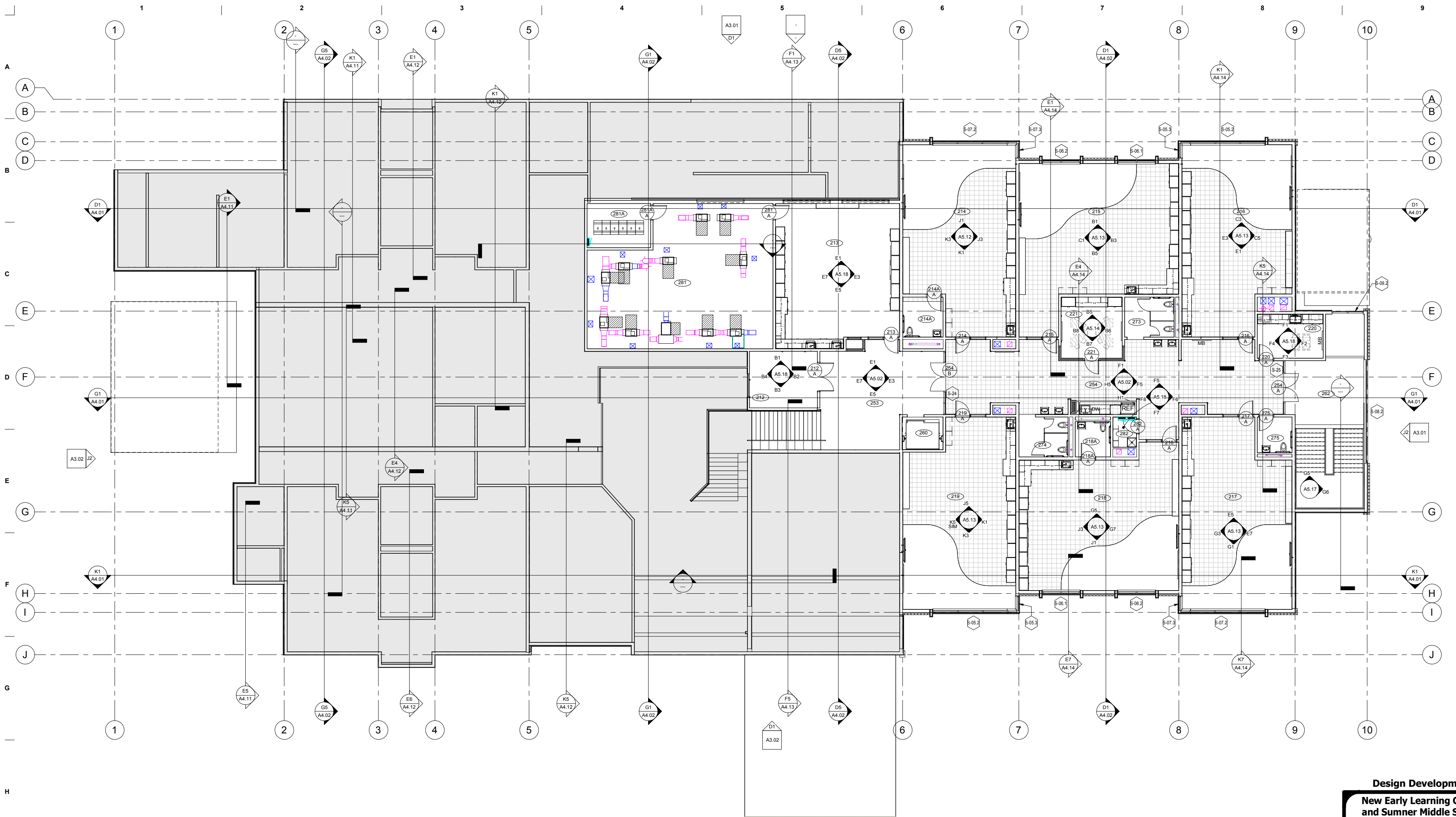
FLOOR PLAN - LEVEL 2 1/8" = 1'-0" @ FULL SIZE 0' 2' 4' 8'