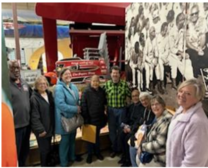
Hydro plane Trip